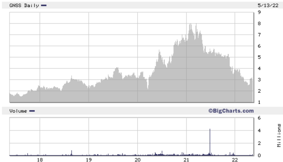
Exhibit 1: Genasys Inc. Stock Price (5-Years)