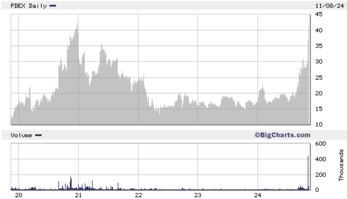
Exhibit 3: Pro-Dex's Stock Price (5-Years)