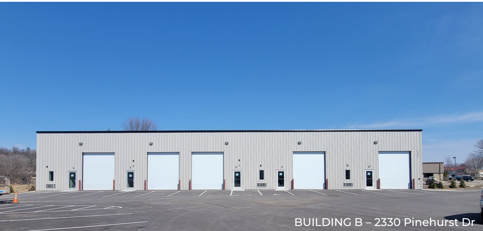
BUILDING B – 2330 Pinehurst Dr