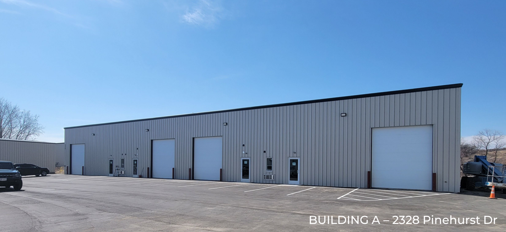
BUILDING A – 2328 Pinehurst Dr

2328 & 2330 Pinehurst Drive, Middleton WI 53562