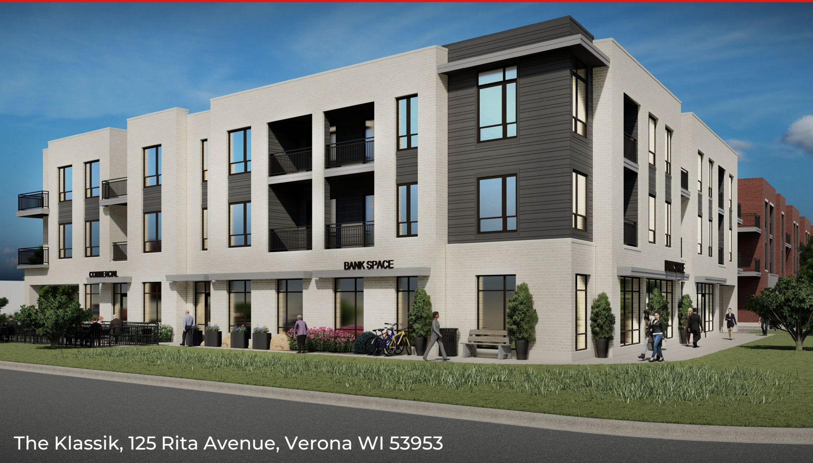
The Klassik, 125 Rita Avenue, Verona WI 53953