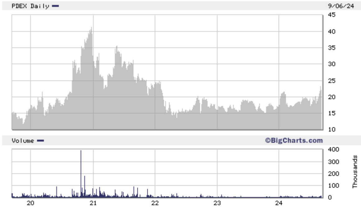
Exhibit 3: Pro-Dex's Stock Price (5-Years)